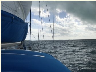
After a warm winter in the Bahamas KLH is taking advantage of spring weather and heading north.