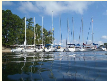
The Brady Mountain crew in Arkansas are celebrating sailing with family, friends, food and a raft up.