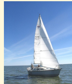
Stuart is looking forward to cocktails, spaghetti supper and a solstice sunset sail.

Check out more events then 'Add your fun' to the map!