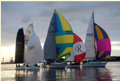
Rose City Yacht Club is hosting the Jack Gainer Memorial Medium Distance Race on the Columbia River.