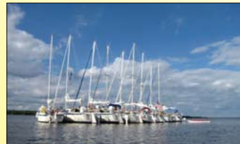
Sailstice, Wisconsin Raft Up

All promotional information will list contributors in order of the value of their sponsor level and retail value of contributed prizes. Position preferences will be given to past sponsors renewing on a first come, first serve basis.