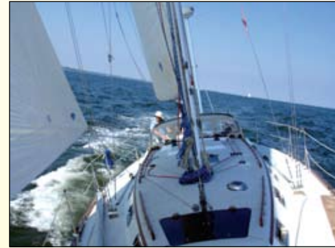
Sailstice, New York, Long Island Sound