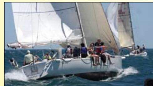
Sailstice, Milwaukee, Wisconsin