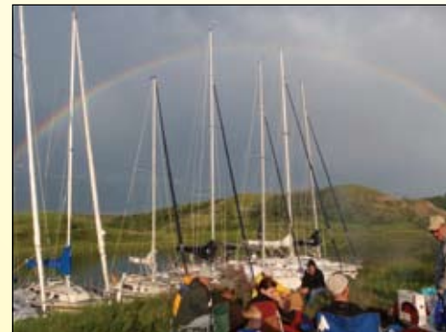
Sailstice, North Dakota