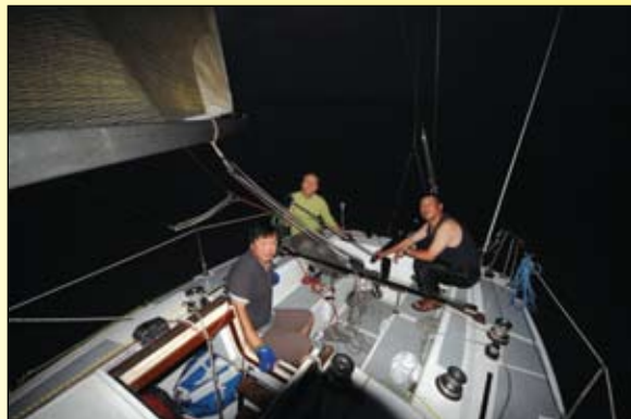
Sailstice, China, Early AM